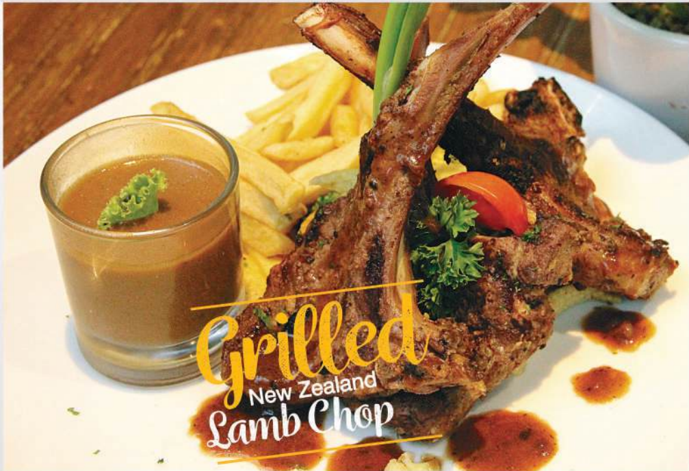
Grilled New Zealand Lamb Chop