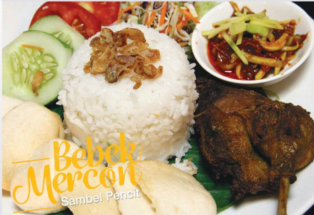
Bebek Mercon Sambel Pencit