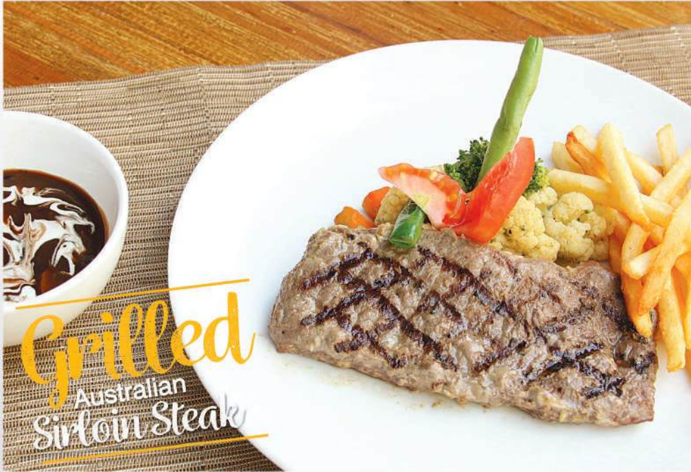
Grilled Australian Sirloin Steak