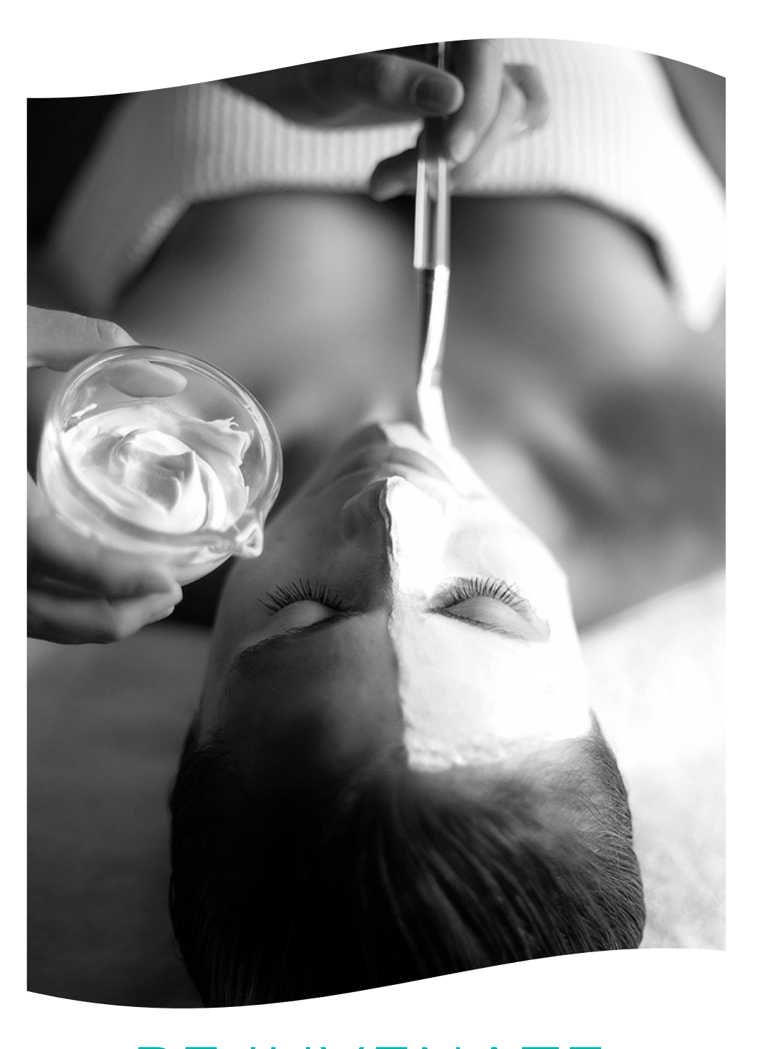
REJUVENATE, THE FRENCH WAY