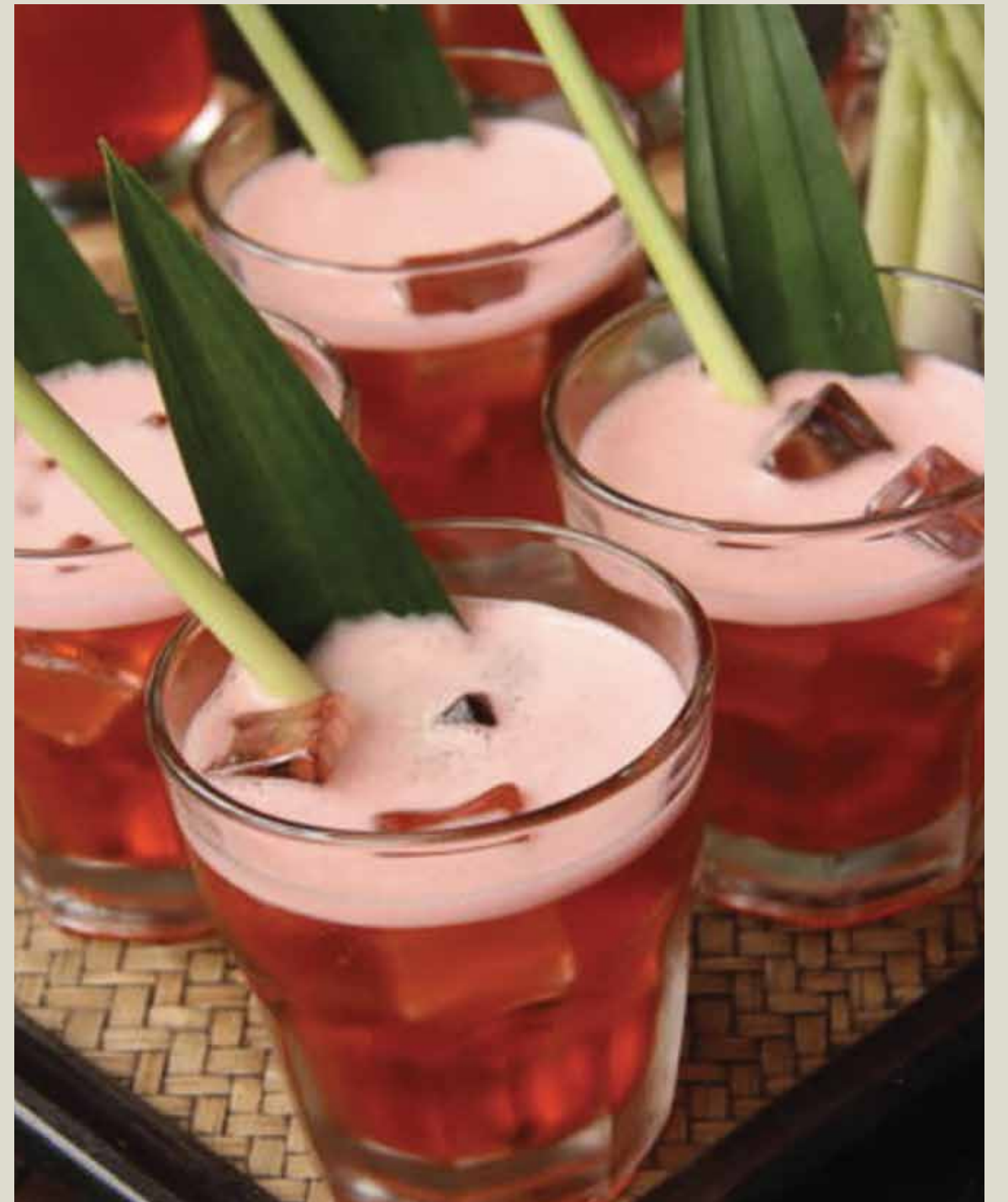
Bir Pletok 45