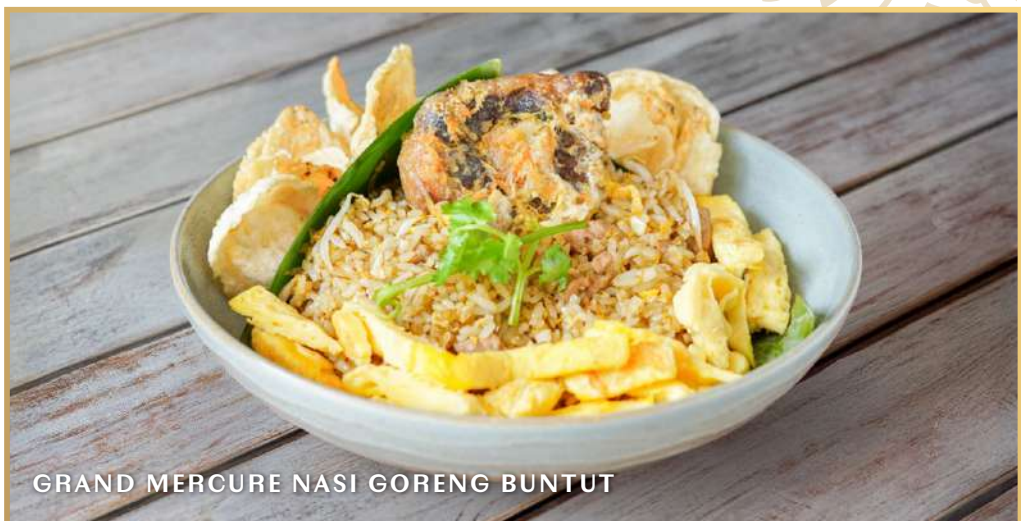
GRAND MERCURE NASI GORENG BUNTUT

*ALL PRICE ARE IN THOUSAND INDONESIAN RUPIAH & SUBJECT TO 21% TAX & SERVICE CHARGE PLEASE LET US KNOW IF YOU HAVE ANY DIETARY REQUIREMENTS OR FOOD ALLERGIES