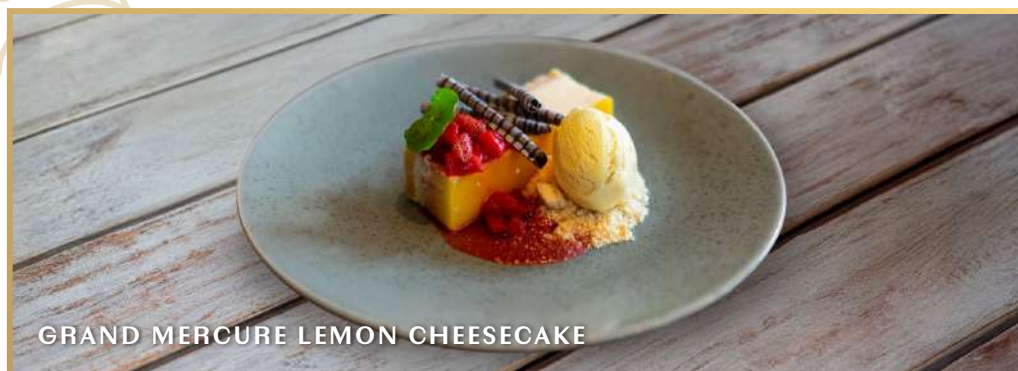
GRAND MERCURE LEMON CHEESECAKE

*ALL PRICE ARE IN THOUSAND INDONESIAN RUPIAH & SUBJECT TO 21% TAX & SERVICE CHARGE PLEASE LET US KNOW IF YOU HAVE ANY DIETARY REQUIREMENTS OR FOOD ALLERGIES