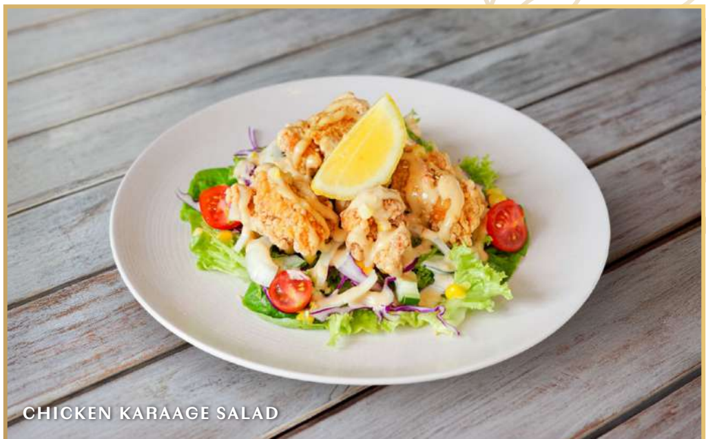
CHICKEN KARAAGE SALAD

*ALL PRICE ARE IN THOUSAND INDONESIAN RUPIAH & SUBJECT TO 21% TAX & SERVICE CHARGE PLEASE LET US KNOW IF YOU HAVE ANY DIETARY REQUIREMENTS OR FOOD ALLERGIES