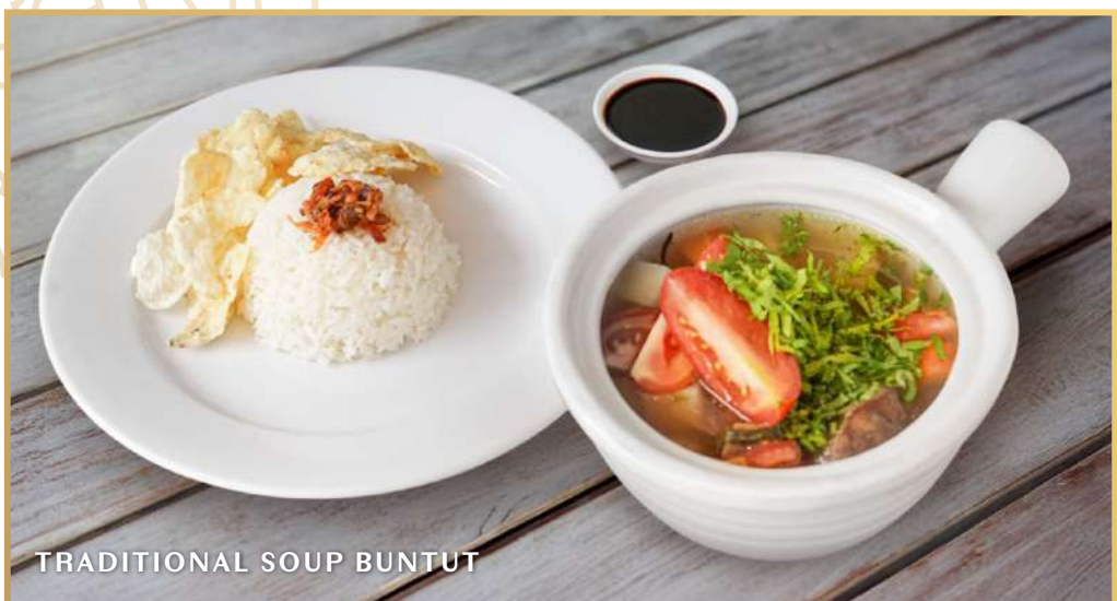
TRADITIONAL SOUP BUNTUT

*ALL PRICE ARE IN THOUSAND INDONESIAN RUPIAH & SUBJECT TO 21% TAX & SERVICE CHARGE PLEASE LET US KNOW IF YOU HAVE ANY DIETARY REQUIREMENTS OR FOOD ALLERGIES