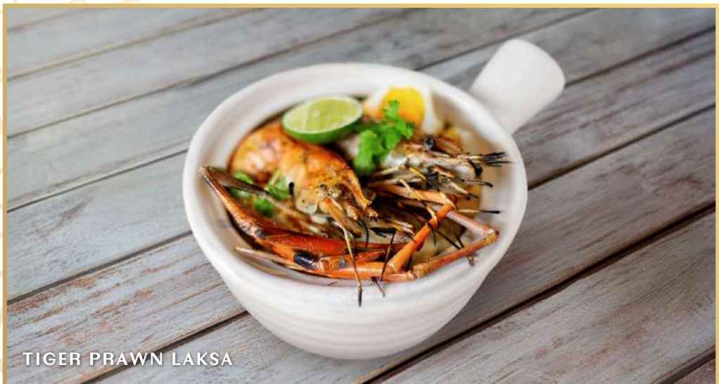
TIGER PRAWN LAKSA