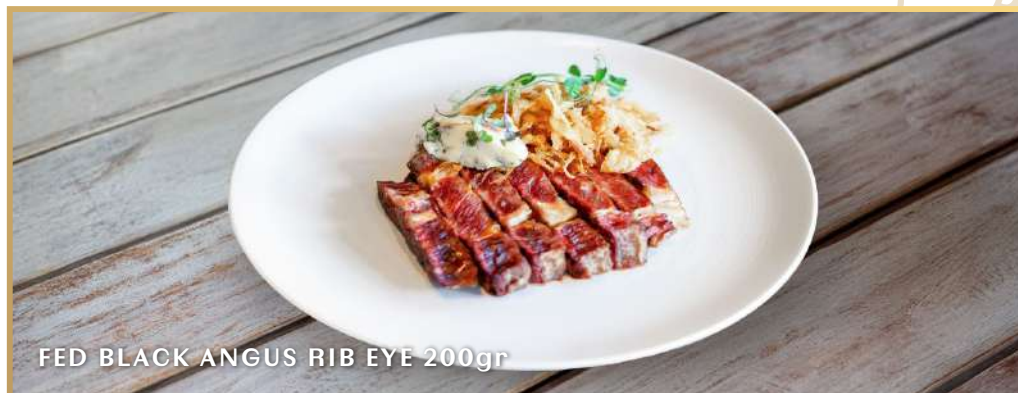
FED BLACK ANGUS RIB EYE 200gr

*ALL PRICE ARE IN THOUSAND INDONESIAN RUPIAH & SUBJECT TO 21% TAX & SERVICE CHARGE PLEASE LET US KNOW IF YOU HAVE ANY DIETARY REQUIREMENTS OR FOOD ALLERGIES