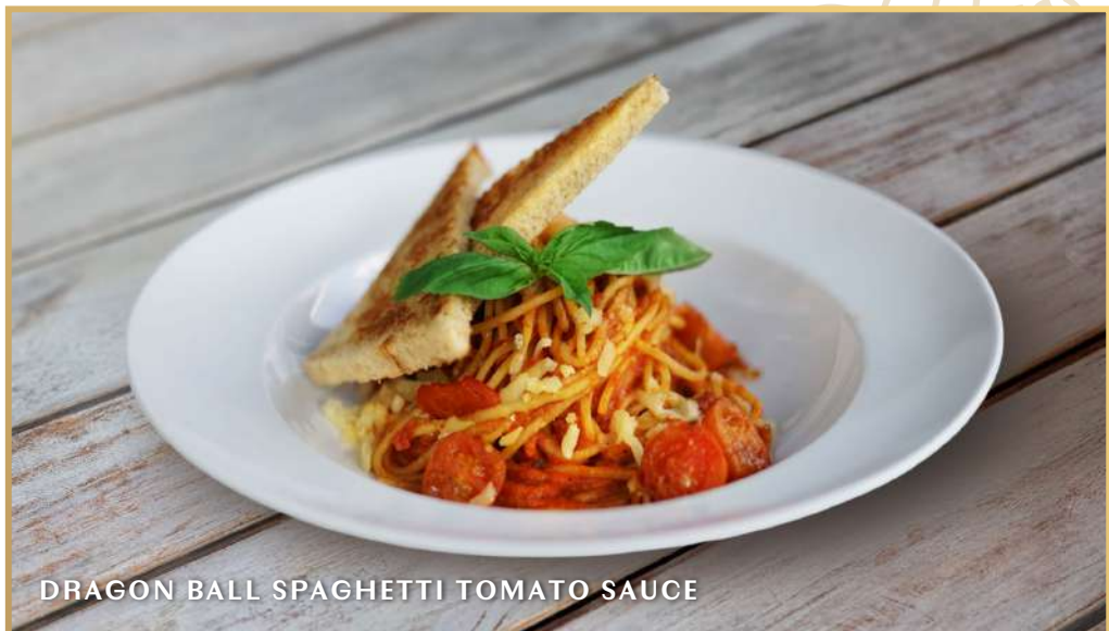
DRAGON BALL SPAGHETTI TOMATO SAUCE

*ALL PRICE ARE IN THOUSAND INDONESIAN RUPIAH & SUBJECT TO 21% TAX & SERVICE CHARGE PLEASE LET US KNOW IF YOU HAVE ANY DIETARY REQUIREMENTS OR FOOD ALLERGIES